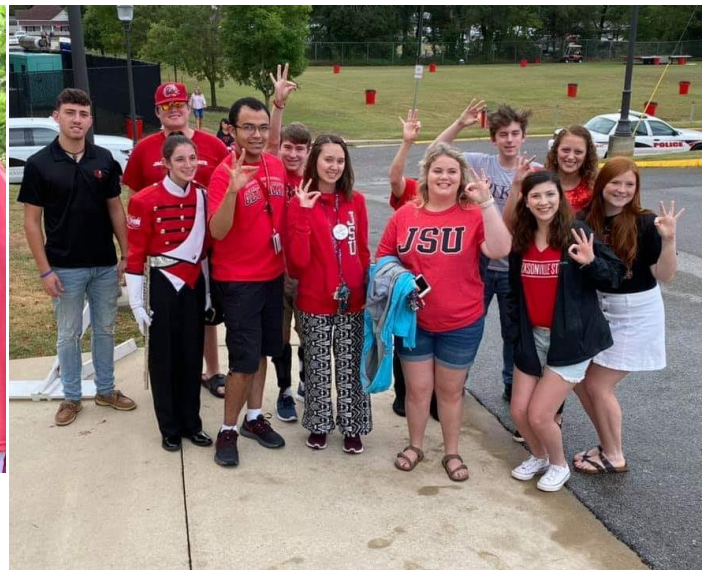
Left: On to JSU Cohort 1 graduates; Right: On to JSU students and their peer mentors received on-field recognition at a JSU home football game in October.