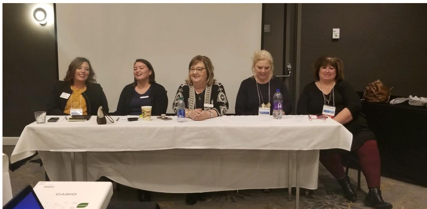
Curriculum and Instruction faculty participate in a co-teaching roundtable at Troy University.

National Co-Teaching Conference in Minnesota. The panel discussion provided opportunity for JSU and Troy Universities to establish a name and a presence across the nation by sharing about the collaborative efforts and implementation of Co-Teaching in their respective programs. Professional relationships were built, and plans have been made to continue the collaboration to strengthen Co-Teaching in both teacher preparation programs in the future.