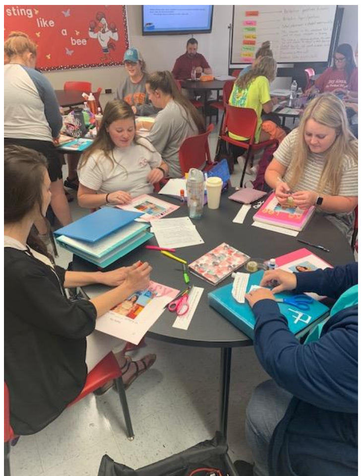
LETRS workshop participants