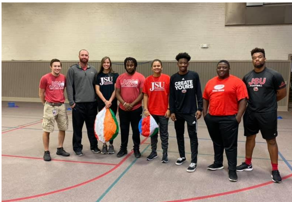
Some of the TU Teacher Candidate Participants

occurred during one of the heaviest rains of the year. Classroom sessions were affected by some schools arriving late, and the recreation activities went from the JSU quad, which was easy for all students to access, to inside the gym the day of the rain. This caused the need for buses to transport students from Ramona Wood to Stephenson and to unload in the downpour at two different locations in order to accommodate those students in wheelchairs. However, in the classrooms, on the quad, or in the gym, once the high school students were in place, the TU lessons and activities were successfully implemented. Both groups of Teacher Candidates feel that not only did the high school students benefit, but that the experience was of great value to both Teacher Education Programs. There is one more TU session remaining this semester and it has already been suggested that this successful collaboration between programs continue next semester and possibly become a permanent fixture of both programs.